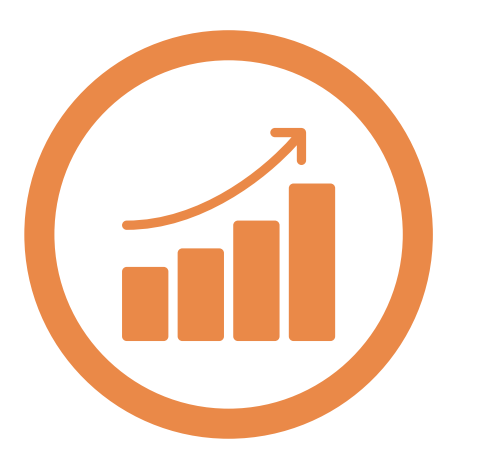
One of the world's fastest growing economies and one of the highest GDP per capita