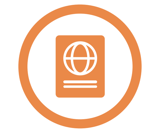
Visa on arrival for over 80 nationalities