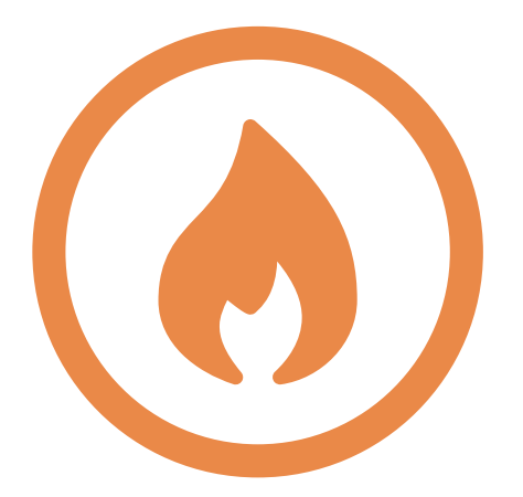
World's leading exporter of LNG