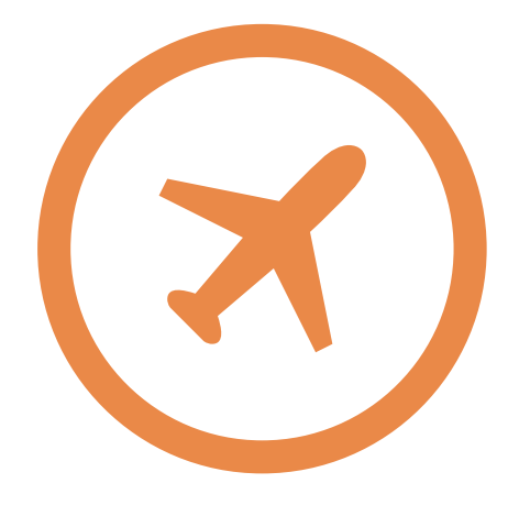
Over 150 direct flights connecting Doha to the world