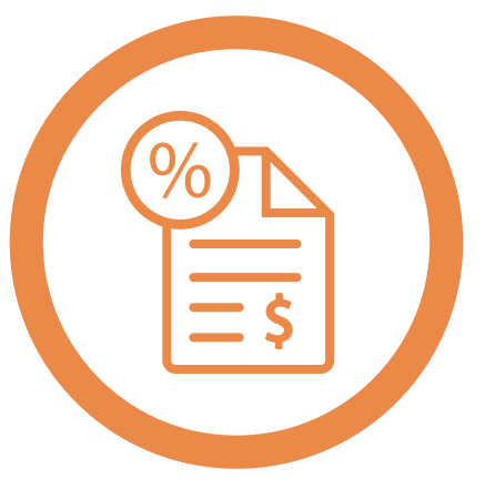
Double Taxation Agreements with over 80 countries